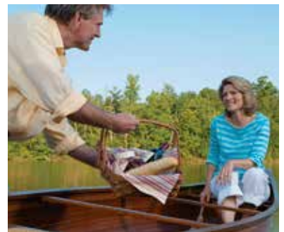
75 ACRES OF COMMUNITY LAKES