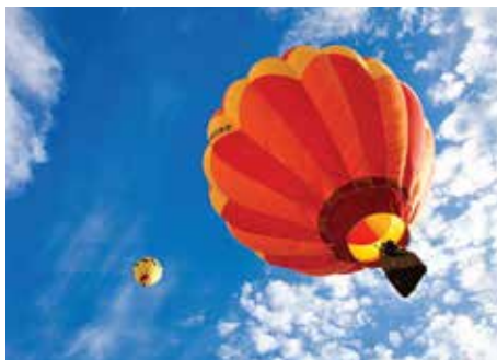
HARVEST BALLOON FESTIVAL